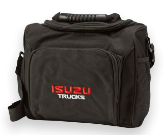
Standard Cooler Bag $34.00ea