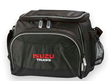
Deluxe Cooler Bag $42.00ea