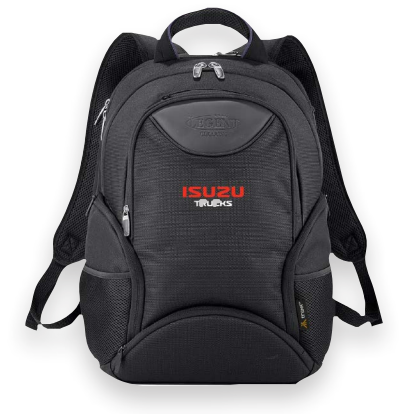
Premium Backpack $100.00ea