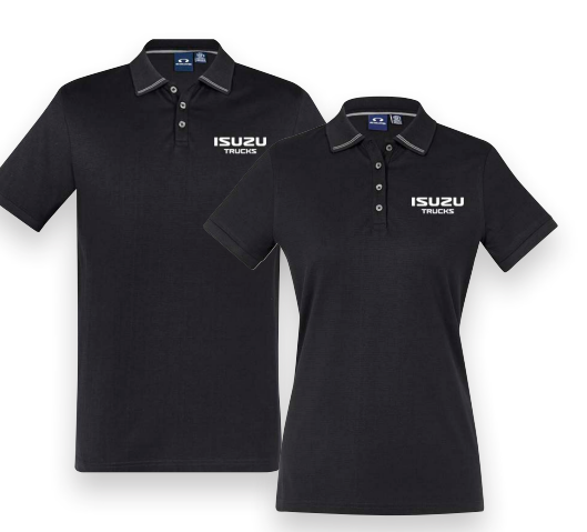
Aston Polos $38.00ea